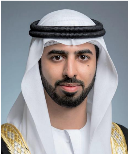
HE Omar Sultan Al Olama Minister of State for Artificial Intelligence

Mohamed bin Zayed University of Artificial Intelligence, Abu Dhabi First AI University